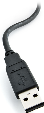
Figure 2: A standard USB type "A" connector.

The Kvaser USBcan R v2 has a standard USB type "A" connector.