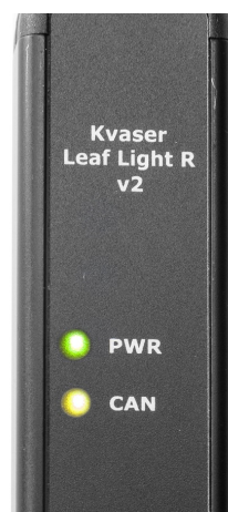
Figure 4: LEDs on the Kvaser Leaf Light R v2.

The Kvaser Leaf Light R v2 has two LEDs as shown in Figure 4. Their functions are shown in Table 2 on Page 9.